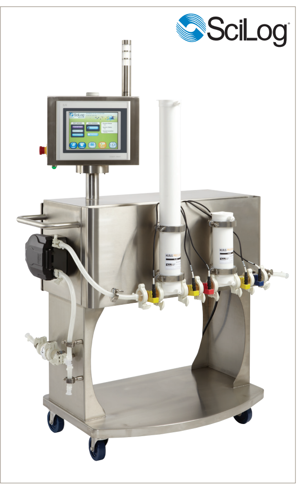
Note: SciLog®, SciFlex® and SciPres® are registered trademarks of Parker Hannifin Corporation.