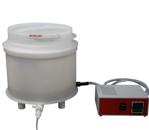
ETC EVO II Standard/PreWired

ETC EVO II Standard, with single controller. Prewired with CRD System (Clean-Rinse-Dry)