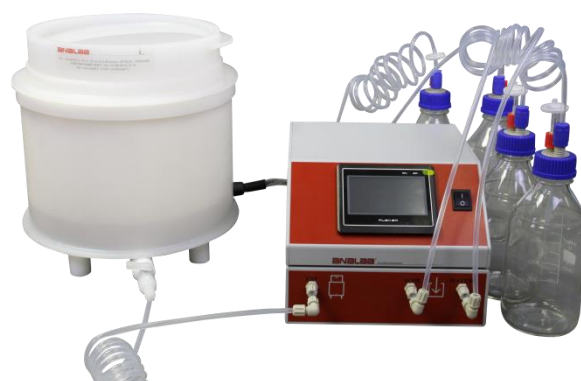
ETC EVO II PreWired with CRD System

Possibility to have 2 Acid option and/or Flask cleaning option